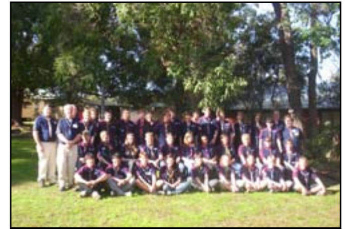
Greater Western Sydney Region Leadership Course (August 2009)

National and International events have also been well attended this year. Ten Venturers completed service at the Australian Jamboree, providing integral support to the activities on offer to the Scouts. During the same time, a further ten Venturers attended the New Zealand Venture where all reports indicated an absolutely amazing experience.