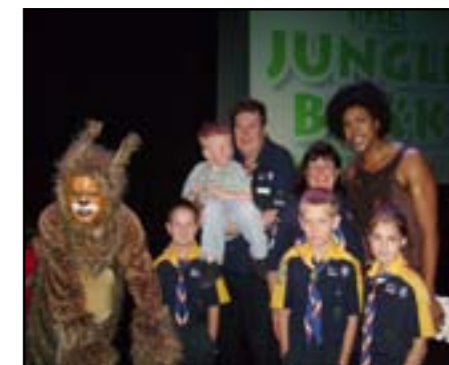
1st Erskine Park Cub Scouts see Jungle Book The Musical