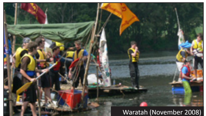
Waratah (November 2008)