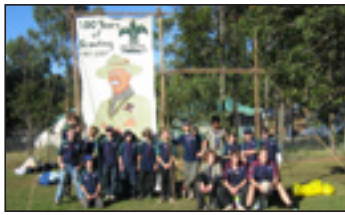
Jamborette Theme Gateways Left - 1st Kings Langley Below - 1st Baulkham Hills