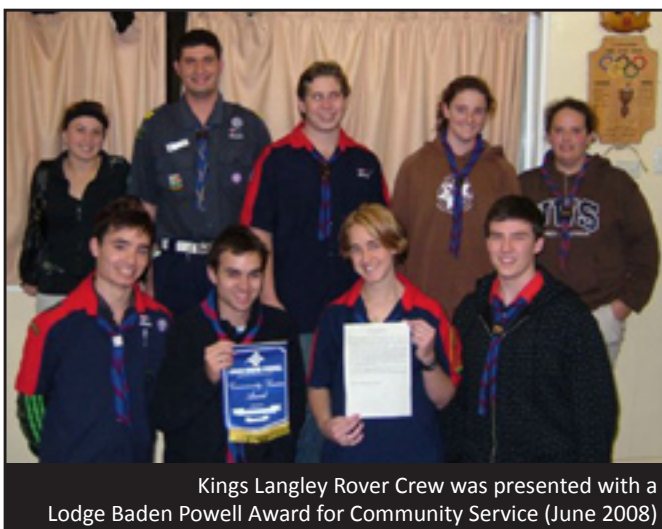
Kings Langley Rover Crew was presented with a Lodge Baden Powell Award for Community Service (June 2008)

GWS is once again joining with HUME region in running the Roventure - it is pirate themed and will be held at Glenfield in the first weekend of the coming school holidays.