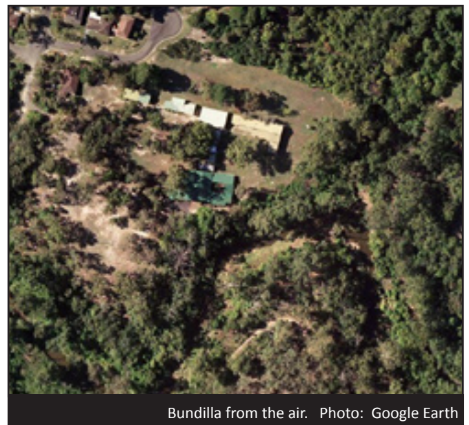
Bundilla from the air.