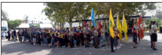
Holroyd District Scouts march in the Holroyd Family Festival Parade

There have been some very hard decisions to be made during the last year to ensure that the members of this District receive the Scouting that they deserve, and to that end some changes have been made to achieve this.